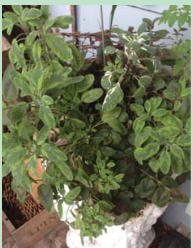
Sage can be added to bouquets or used as incense.