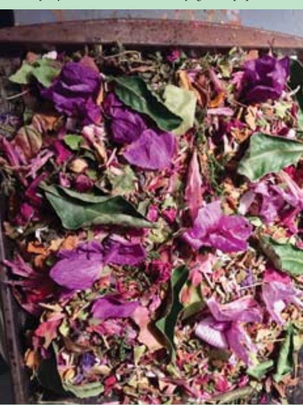
Drying flowers and herbs on a cookie sheet.