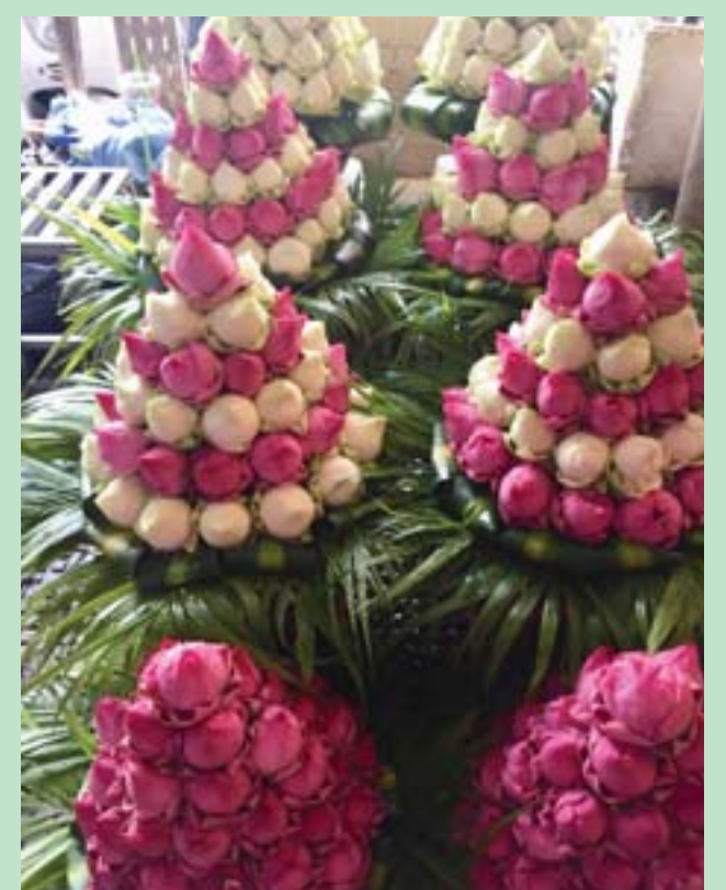
The lotus flower symbolizes peace and protection.